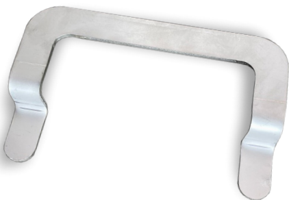
Optional stainless steel connection clamps; item sold separately – GPM-SC