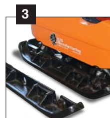
3 Removable extension plates accommodate use in narrow areas