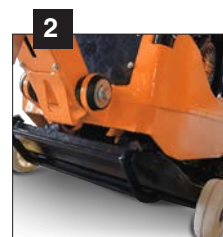
2 Optional wheel kit for easy mobility around jobsite and storage