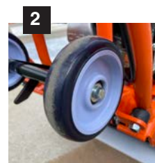
Integrated wheel kit drops and locks for easy transport of equipment.