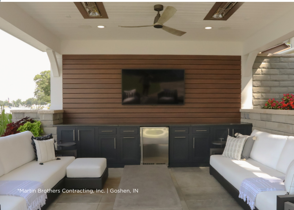
*Martin Brothers Contracting, Inc. | Goshen, IN