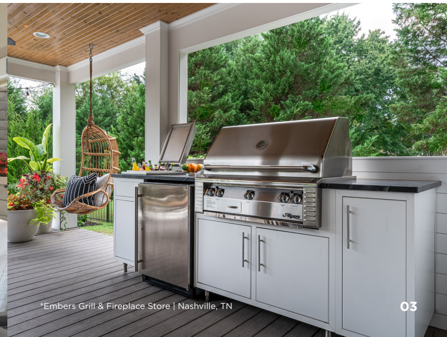
*Embers Grill & Fireplace Store | Nashville, TN