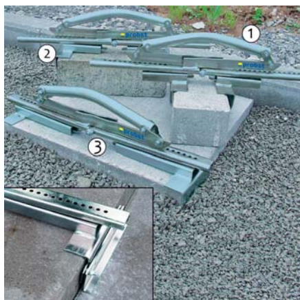
1. PPH-10/37, 2. PPH-22/50, 3. PPH-33/62, bottom: PPH-AA