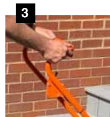
Stow and go folding handle with durable rack and pinion throttle lever located at operator's hand.