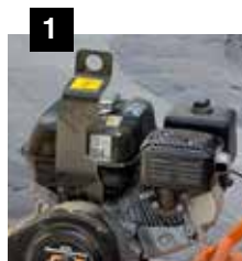
Lifting bail for secure lift. Reliable Honda® GX160 power source.