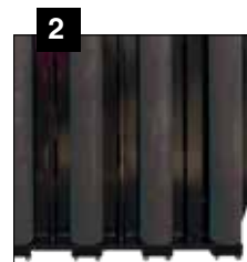
Replaceable rubber coated rollers protect pavers, prevent chipping & scuffing.