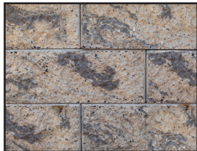
GRANITE CITY BLEND