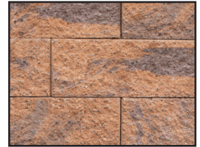
GOLDEN BROWN BLEND