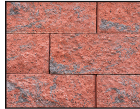
FIRE ISLAND BLEND