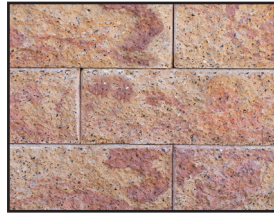
CRAB ORCHARD BLEND