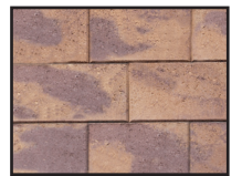
GOLDEN BROWN BLEND