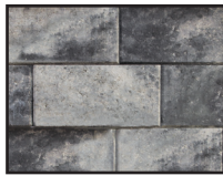
GRAPHITE PEARL BLEND*