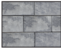
GRANITE CITY BLEND