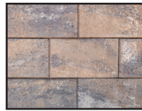
SOUTH BAY BLEND