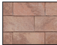
CRAB ORCHARD BLEND