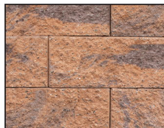
GOLDEN BROWN BLEND