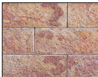
CRAB ORCHARD BLEND