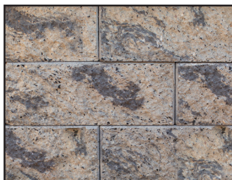
GRANITE CITY BLEND