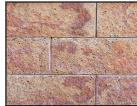
CRAB ORCHARD BLEND