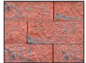
FIRE ISLAND BLEND