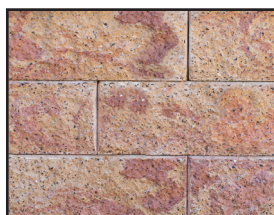
CRAB ORCHARD BLEND