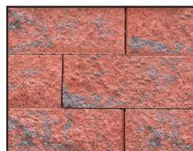
FIRE ISLAND BLEND