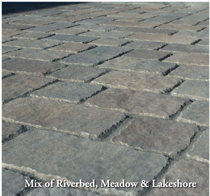
Mix of Riverbed, Meadow & Lakeshore