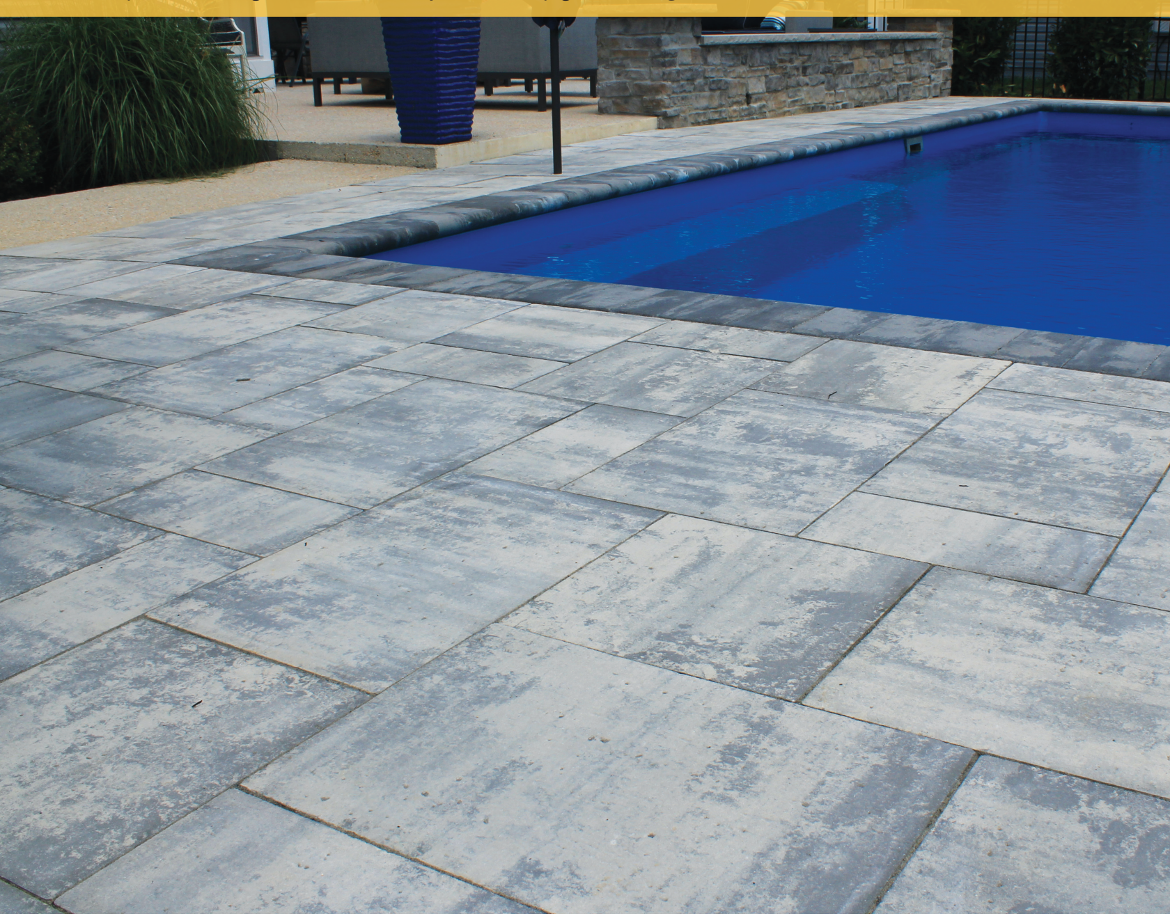
Fiuggi Travertine | Color: Marble Blend

paver-shield <sup>™</sup> has a tight, smooth surface texture and will not expose heavy aggregate as it wears. Ultra-dense surface has more color and more protection. Nicolock has color from top to bottom throughout the paver ensuring a lifetime of beauty. Iron oxide pigments are guaranteed not to fade!